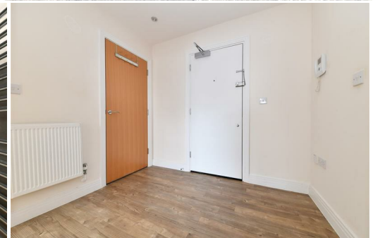
Skyline House, Swingate Stevenage | SG1 1AP